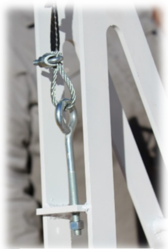
Use 9/16" socket to turn bolt, this will tighten the cable and straighten the arm